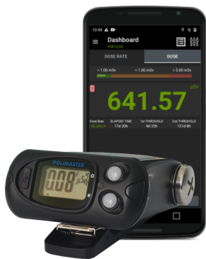
Free Polimaster® iOS and Android App for advanced operation