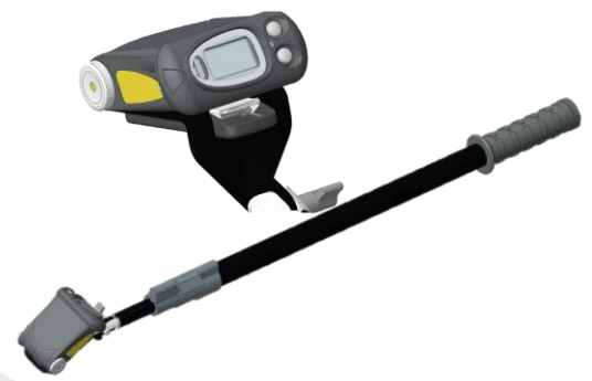
Optional telescopic extension pole for remote operation and surveys in hard-to-reach places

Polimaster Inc. 45645 Willowpond Plaza, Suite 100, Sterling, VA, 20164, USA phone: +1 703 525 5075 fax: +1 703 525 5079 info@polimaster.us